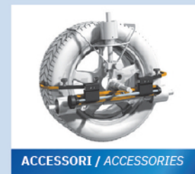
ACCESSORI / ACCESSORIES